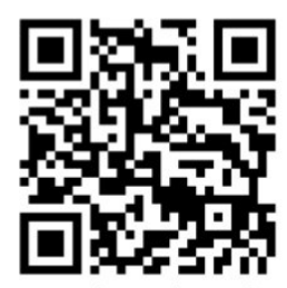
Voyent Alert! Register Today!

The Village has chosen the Voyent Alert! service to communicate important & day-to-day information to our residents. The service is free & easy to use. We encourage you to register to receive these important alerts. You can choose to receive alerts on the Voyent Alert! app, by email, text message or phone call. Register today!